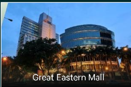
Great Eastern Mall