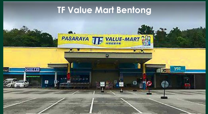
TF Value Mart Bentong