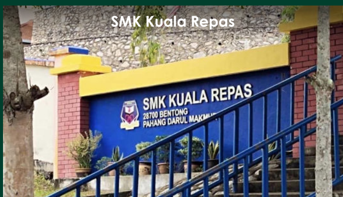
SMK Kuala Repas