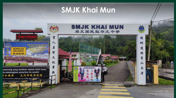
SMJK Khai Mun