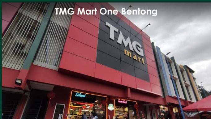
TMG Mart One Bentong