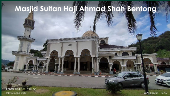
Masjid Sultan Haji Ahmad Shah Bentong