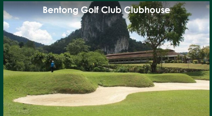
Bentong Golf Club Clubhouse