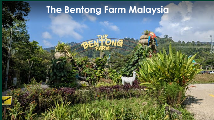
The Bentong Farm Malaysia