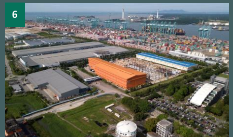
6 PORT OF TANJUNG PELEPAS (22 KM)