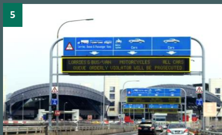
5 CIQ SULTAN ABU BAKAR TANJUNG KUPANG (CIQ 2ND LINK) (20 KM)