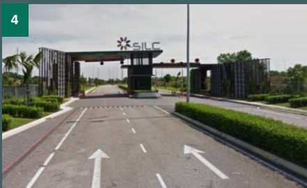
4 I-TECHVALLEY @ SILC (9 KM)