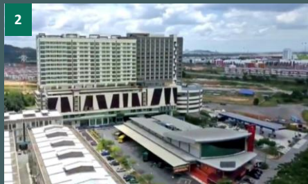
2 GP MALL & GP SENTRAL (4 KM)