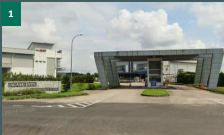
1 ALAM JAYA BUSINESS PARK (1 KM)