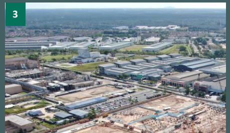
3 KAWASAN PERINDUSTRIAN SILC (6 KM)