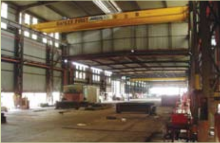
Section 15, Shah Alam, Selangor