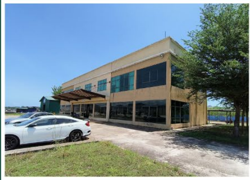
OFFICE & ADMINISTRATION