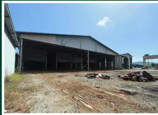
ASSEMBLY LINE FACTORY