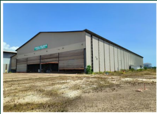
ASSEMBLY LINE FACTORY