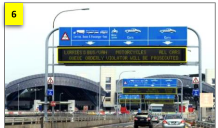
6 CIQ SULTAN ABU BAKAR TANJUNG KUPANG (CIQ 2ND LINK) (23 KM)