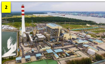
2 TANJUNG BIN POWER STATION (16 KM)