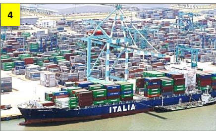
4 PORT OF TANJUNG PELEPAS (18 KM)