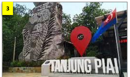
3 TAMAN NEGARA TANJUNG PIAI (17 KM)