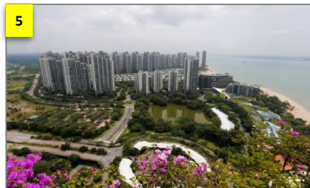
5 FOREST CITY (22 KM)