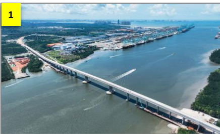
1 SUNGAI PULAI BRIDGE (9 KM)