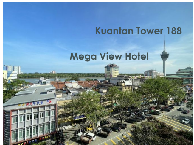
Panoramic View Of Kuantan River, Kuantan Tower 188 & the business street of Kuantan City Centre