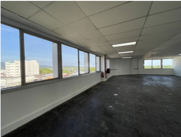
View Of Typical Office Space