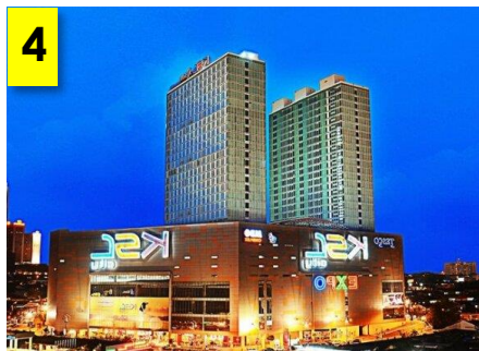
4 KSL City Mall / Hotel & Resort (2 KM)