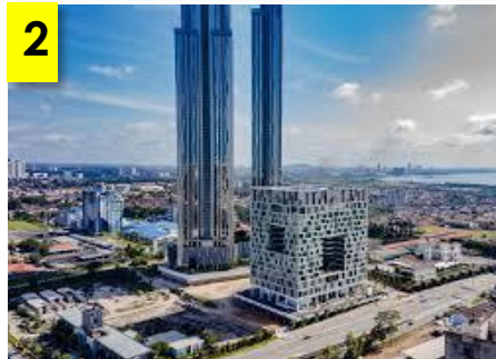
2 THE ASTAKA & MENARA MJB (1 KM)