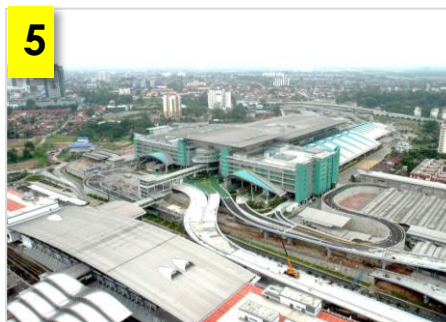
5 SULTAN ISKANDAR CIQ COMPLEX (3 KM)