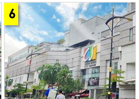
6 JB CITY SQUARE & KOMTAR JBCC (3 KM)