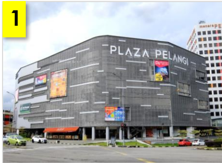
1 PLAZA PELANGI (250 M)