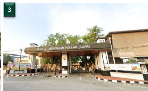
Poi Lam High School