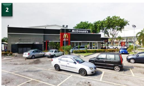
McDonald's Station 18