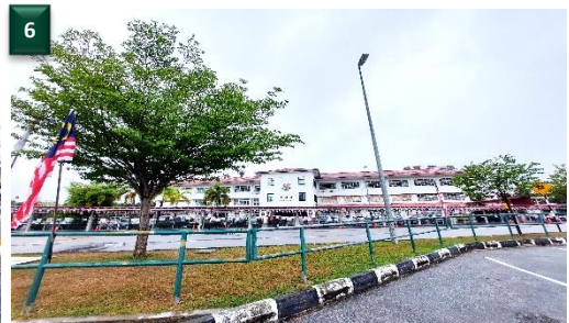
SRJK Bandar Seri Botani