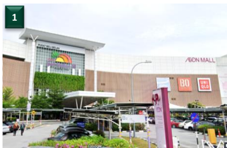
Aeon Mall Station 18