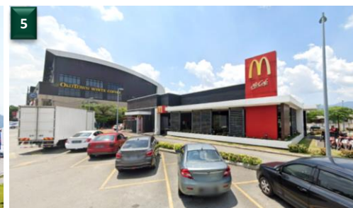
McDonald's & Old Town White Coffee JKK