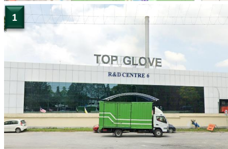
Top Glove Ipoh Plant