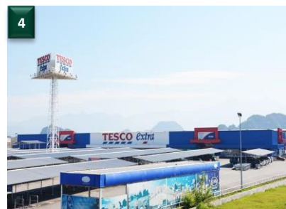
Lotus's Ipoh Hypermarket (Tesco Extra)