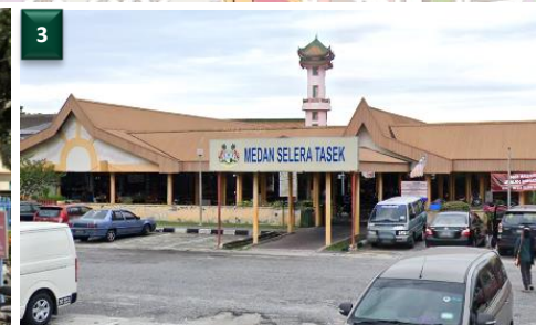
Medan Selera Tasek