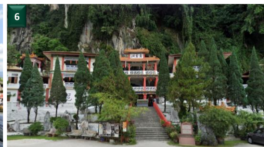
Perak Cave Temple