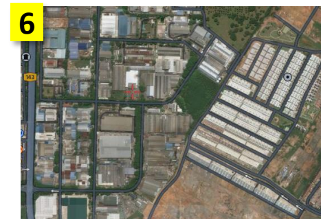
AYER KEROH INDUSTRIAL