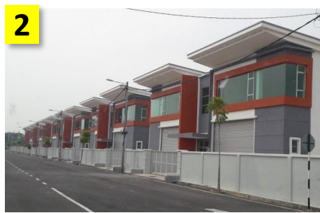
INDUSTRI ANGKASA NURI