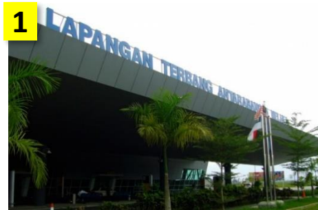
MELAKA INTERNATIONAL AIRPORT