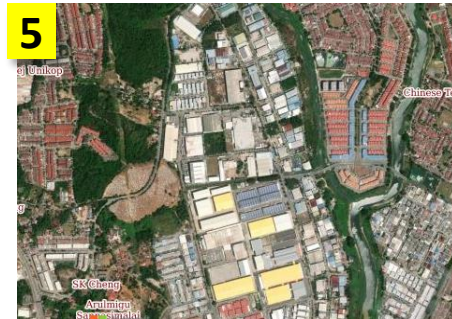
CHENG INDUSTRIAL AREA