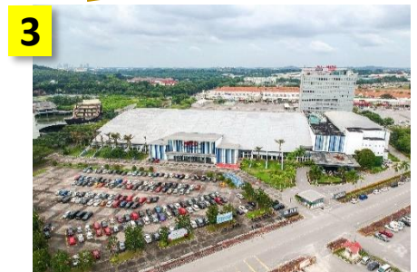
MELAKA INTERNATIONAL TRADE CENTRE (MITC)