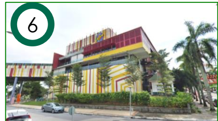
CHERAS LEISURE MALL