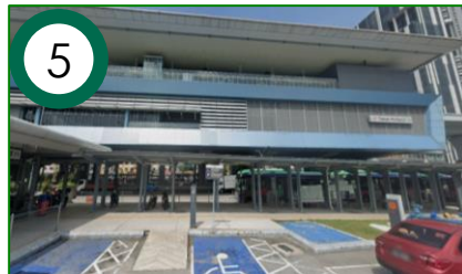
MRT TAMAN MUTIARA