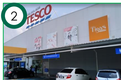
LOTUS'S BANDAR PUTERI BANGI