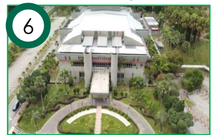
UNIVERSITI KEBANGSAAN MALAYSIA