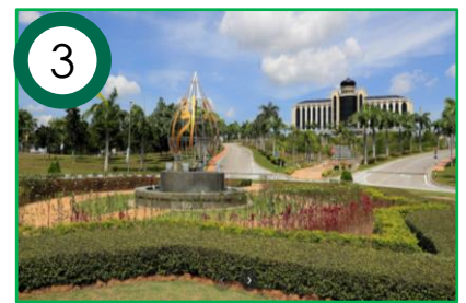
UNIVERSITI SAINS ISLAM MALAYSIA