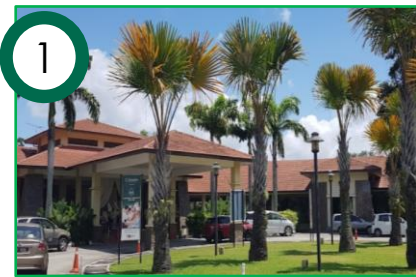
BUKIT MAHKOTA CLUB HOUSE