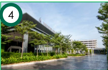
BANGI AVENUE CONVENTION CENTRE