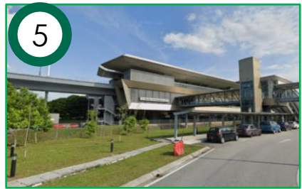
BANDAR TUN HUSSEIN ONN MRT