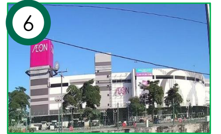
AEON MALL CHERAS SELATAN