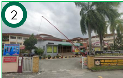
BANDAR BARU SG LONG SECONDARY SCHOOL