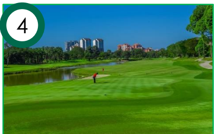
SG LONG GOLF & COUNTRY RESORT