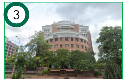
UNIVERSITI TUNKU ABDUL RAHMAN