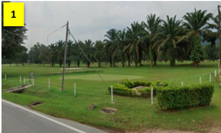
Dublin Golf Club (1km)