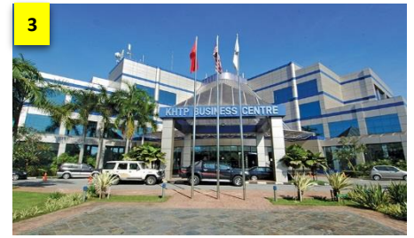
Kulim Hi-Tech Park (20km)