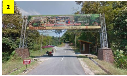
Sungai Sedim Forest Eco Park (18km)