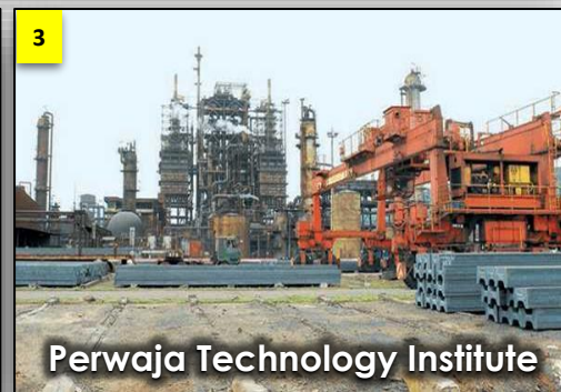
Perwaja Technology Institute