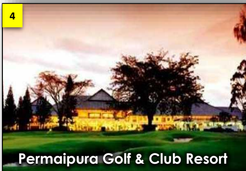
Permaipura Golf & Club Resort