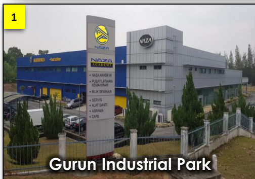
Gurun Industrial Park