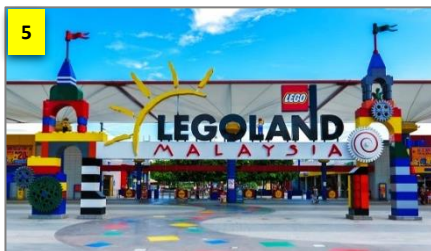
LEGOLAND MALAYSIA (15KM)