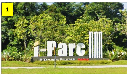
I-PARC @ TANJUNG PELEPAS (500M)