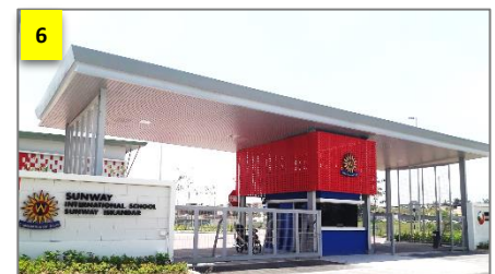
SUNWAY INTERNATIONAL SCHOOL (JOHOR) (17KM)