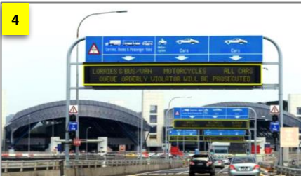
CIQ SULTAN ABU BAKAR TANJUNG KUPANG (CIQ 2ND LINK) (9KM)