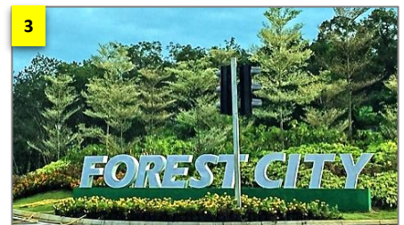
FOREST CITY (9KM)