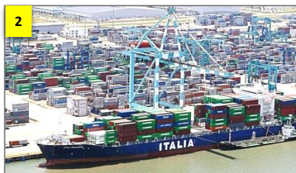
PORT OF TANJUNG PELEPAS (4KM)