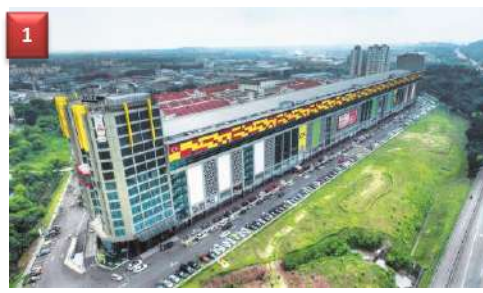
1 Ideal Convention Centre