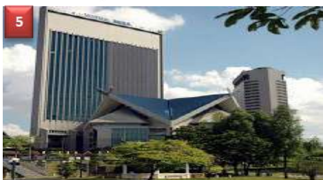
5 Shah Alam City Council