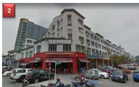
2 Seksyen 15 Commercial Area