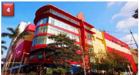
4 Plaza Alam Sentral