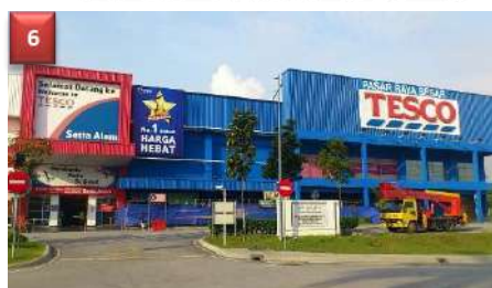
6 Tesco Extra Shah Alam