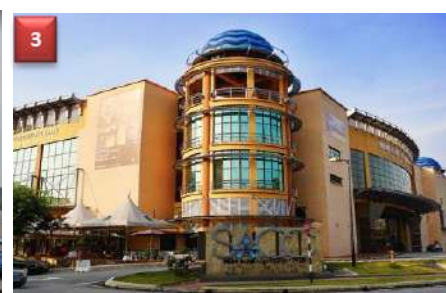
3 Shah Alam Convention Centre