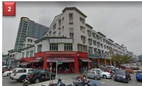
2 Seksyen 15 Commercial Area