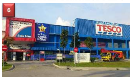
6 Tesco Extra Shah Alam