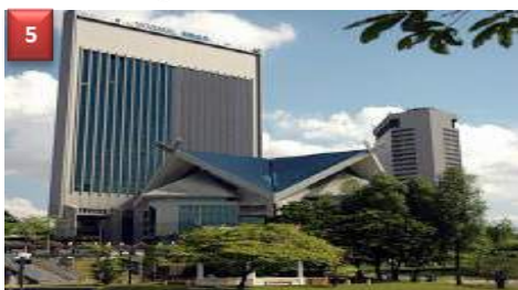
5 Shah Alam City Council