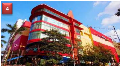
4 Plaza Alam Sentral