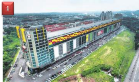
1 Ideal Convention Centre