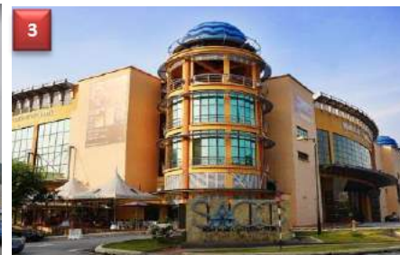
3 Shah Alam Convention Centre