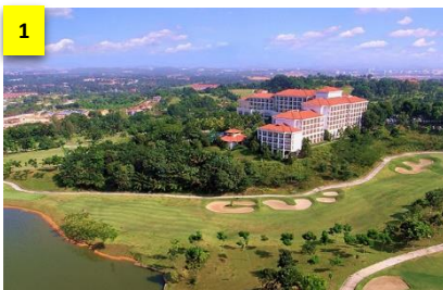
Bangi Golf Resort