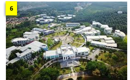
Nottingham University Malaysia