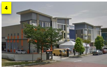
Bandar Teknologi Kajang