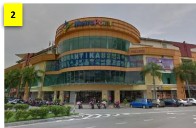
Metro Point Kajang