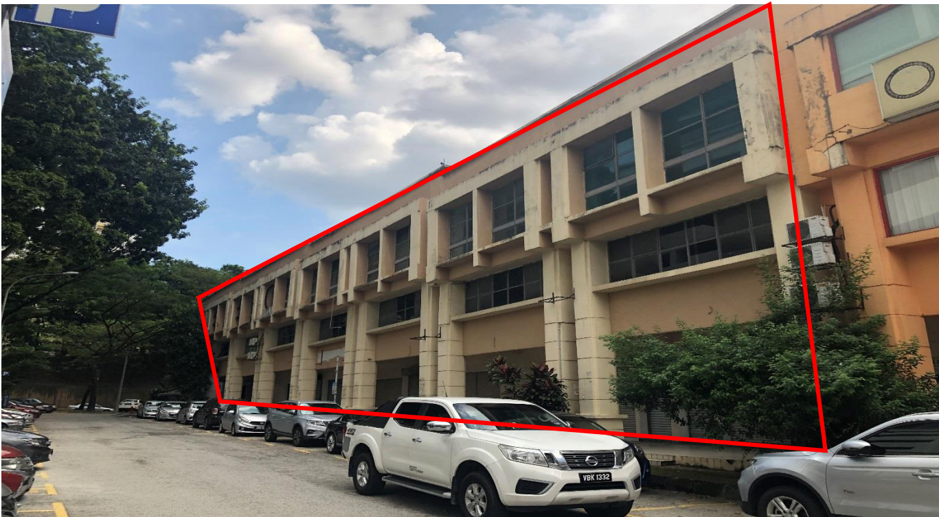
General view of the Subject Properties