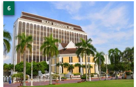
Ipoh City Council