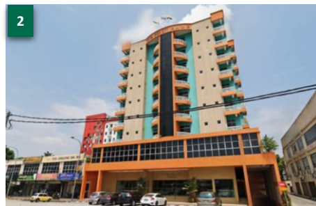
Hotel Ipoh City