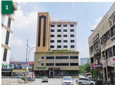
Grand View Hotel