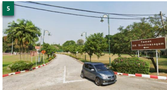
Dr. Seenivasagam Recreation Park