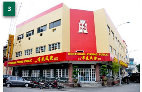
Public Pusing Seafood Restaurant