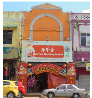
View of the Subject Property