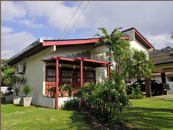
Front view of Garden