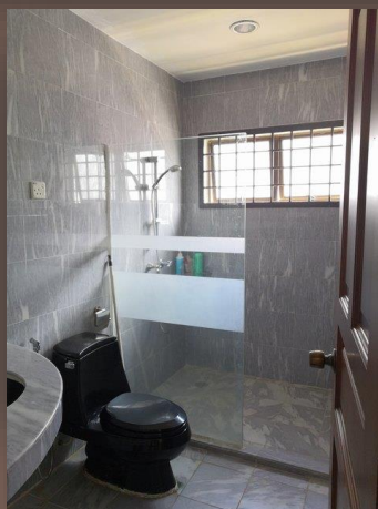
View of one of the bathrooms