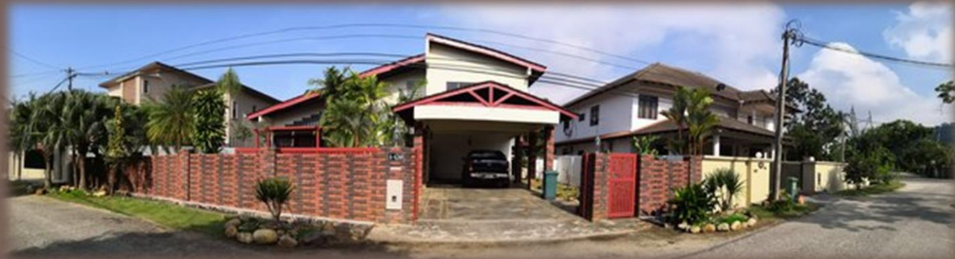
General View of the Main Entrance of the Subject Property